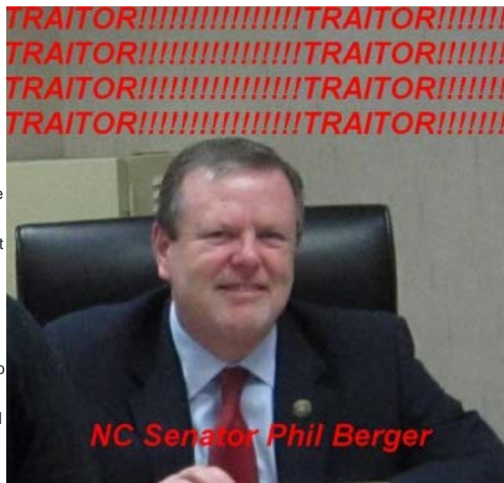
Let's all head to his office and the Mayodan Town Council meeting on July 9th 2012 and call him what he really is, a sellout and traitor!!!! It's our 1st Amendment right to call him a real traitor!!!